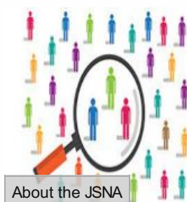
About the JSNA