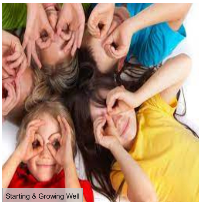
Starting & Growing Well